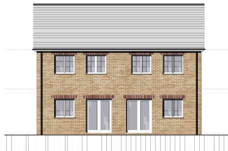
REAR ELEVATION (03) | 1:50