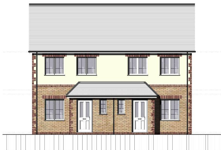
FRONT ELEVATION (01) | 1:50