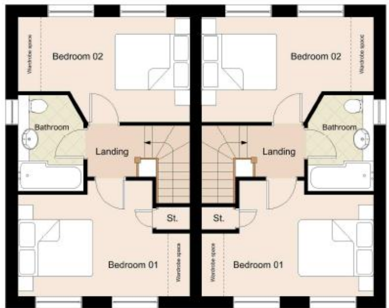
FIRST FLOOR PLAN | 1:50

Kindly note the above drawings are not to scale