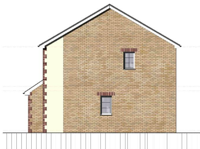
SIDE ELEVATION (02) | 1:50