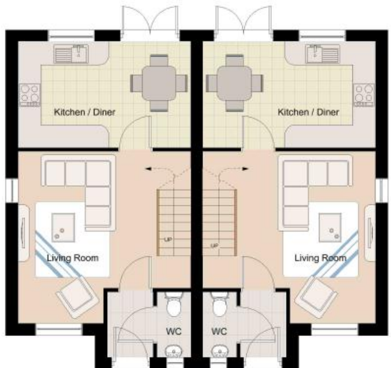
GROUND FLOOR PLAN | 1:50

Kindly note the above drawings are not to scale