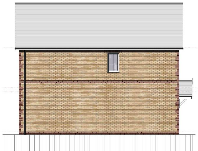
SIDE ELEVATION (04) | 1:50