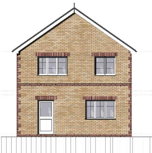
REAR ELEVATION (03) | 1:50

Kindly note the above drawings are not to scale