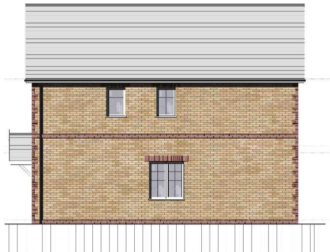
SIDE ELEVATION (02) | 1:50

Kindly note the above drawings are not to scale