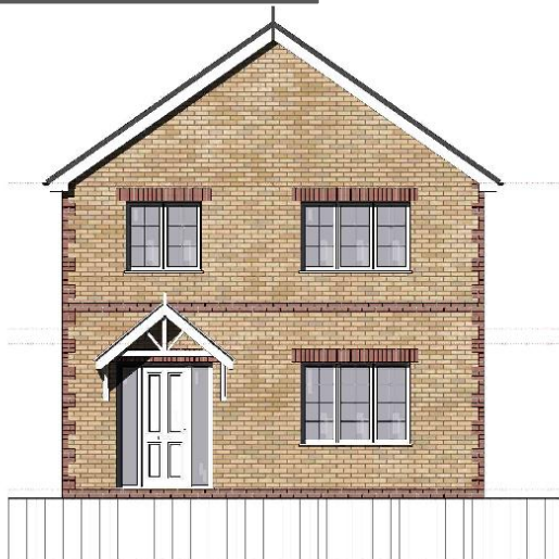
FRONT ELEVATION (01) | 1:50