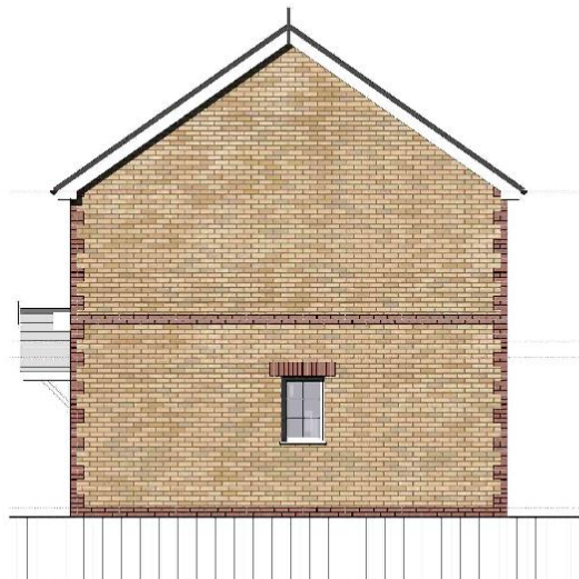
SIDE ELEVATION (02) | 1:50