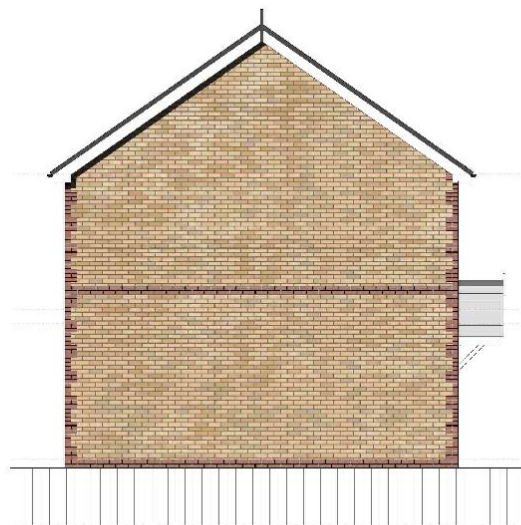
SIDE ELEVATION (04) | 1:50