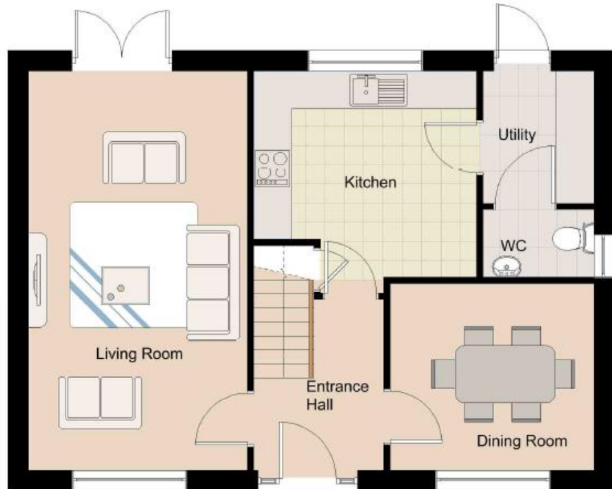
GROUND FLOOR PLAN | 1:50