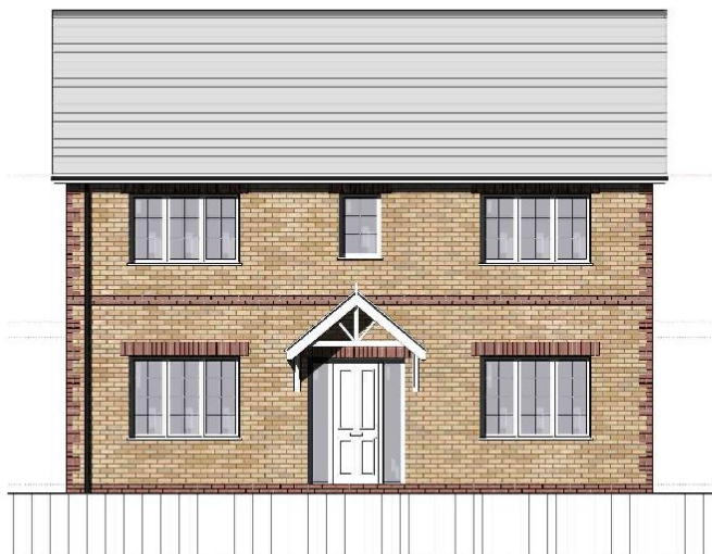
FRONT ELEVATION (01) | 1:50

Kindly note the above drawings are not to scale