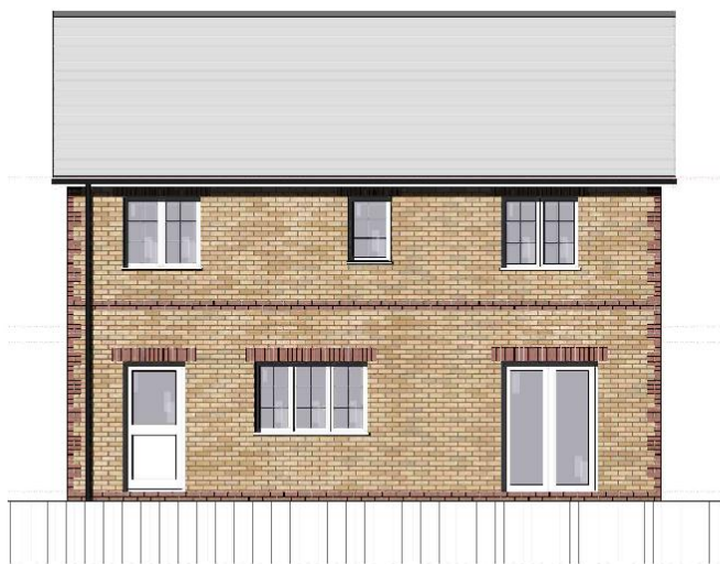
REAR ELEVATION (03) | 1:50