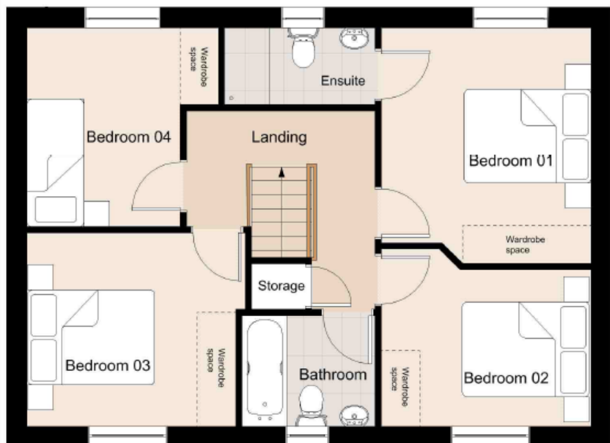
FIRST FLOOR PLAN | 1:50

Kindly note the above drawings are not to scale